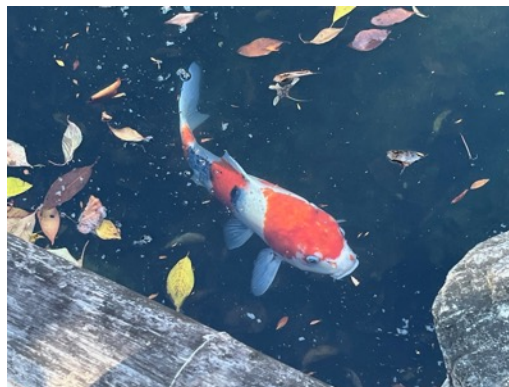
A visit to Sojiji Temple